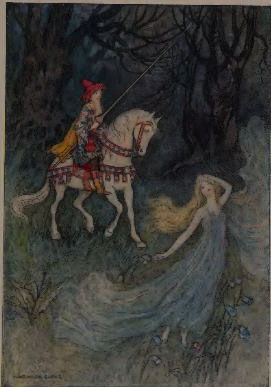
'AN ELF QUEEN WILL I VERILY LOVE'